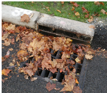
Catch basin with curb inlet