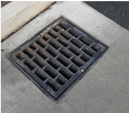
Catch basin as seen from street