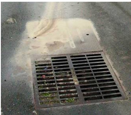
Catch basin with treatment