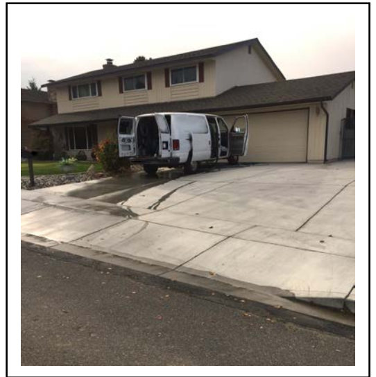
Carpet cleaner emptying waste water into driveway, Wenatchee.

The effectiveness of the program was evaluated based on the number of businesses who were disposing of wastewater in accordance with the “Dump Smart Tips for Properly Handing Waste Water when Carpet Cleaning” and how many businesses were carrying spill kits. Responses from the test population were compared to the control population to determine if there was a significant difference in the wastewater disposal practices and spill preparedness between the two groups.