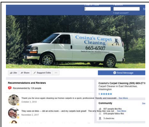
Example of carpet cleaning van showing different phone number than website